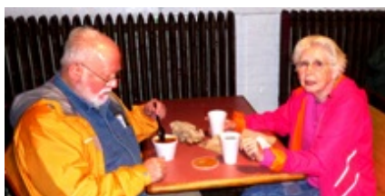
This couple enjoying the show