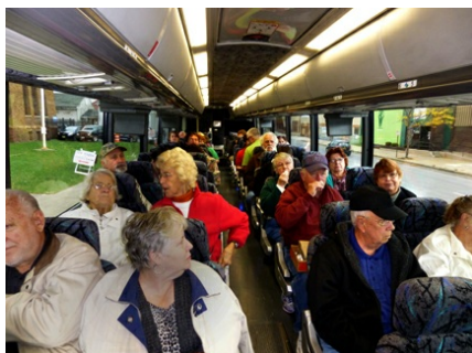
Happy crew on the bus