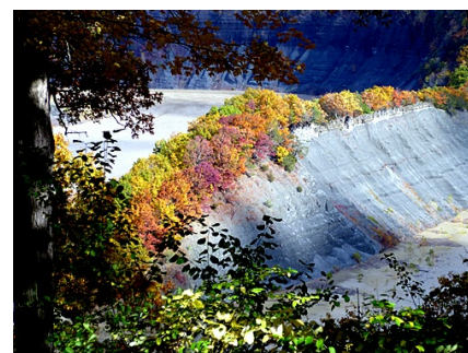
One stop at the park