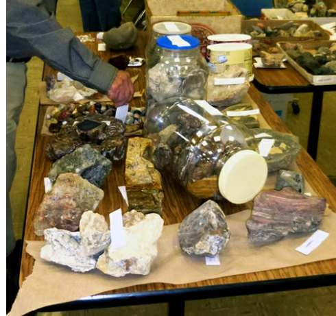
The Far End of the Tables